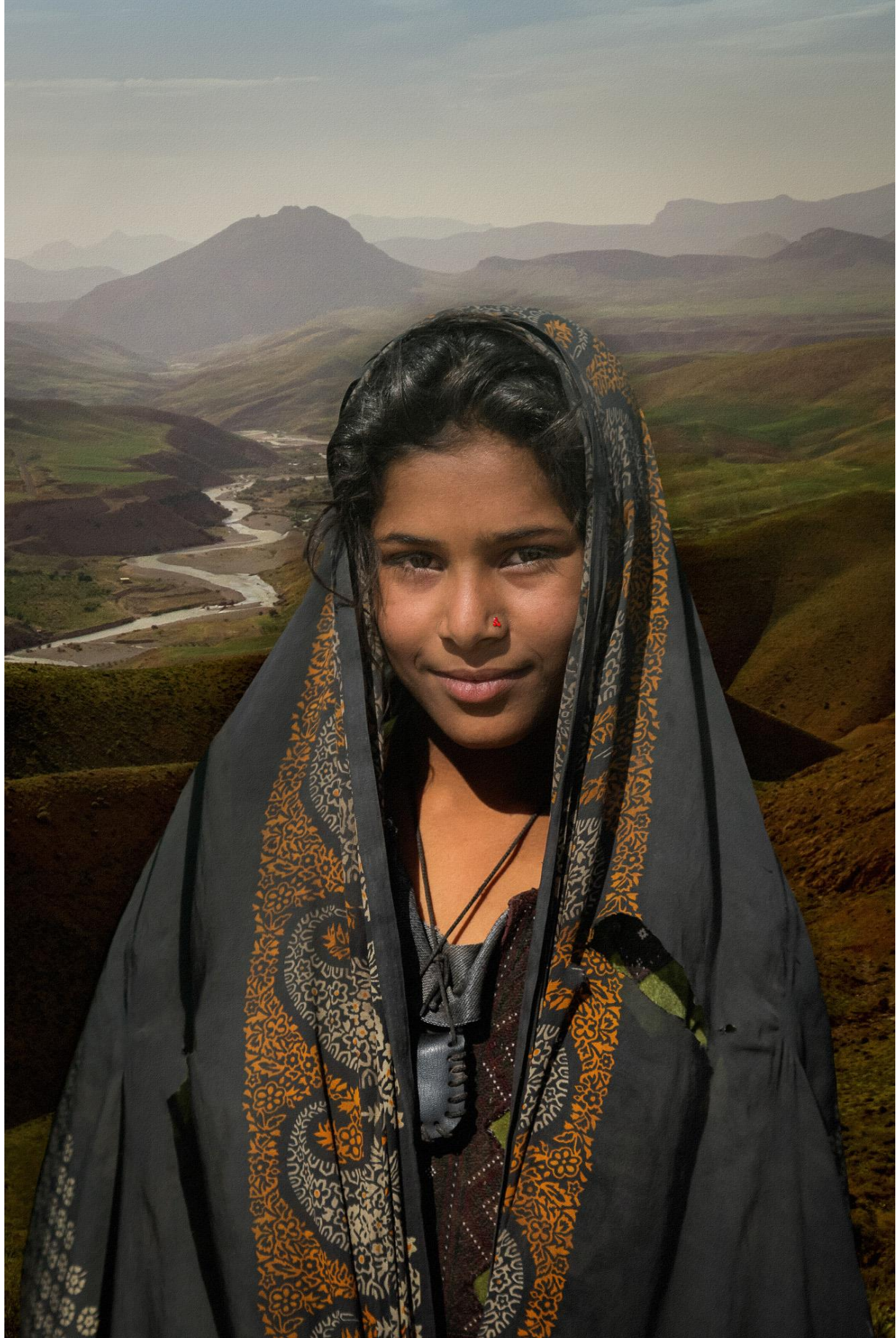
My Mona Lisa, 2017, +AP, Edition 2-5, 75x50.75 cm