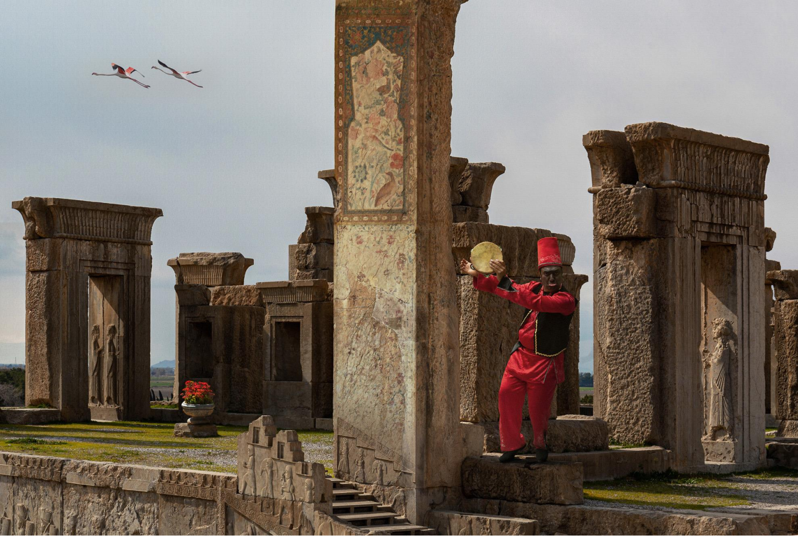
Good news of Nowruz, 2019, +AP, Edition 1-5, 60x90 cm