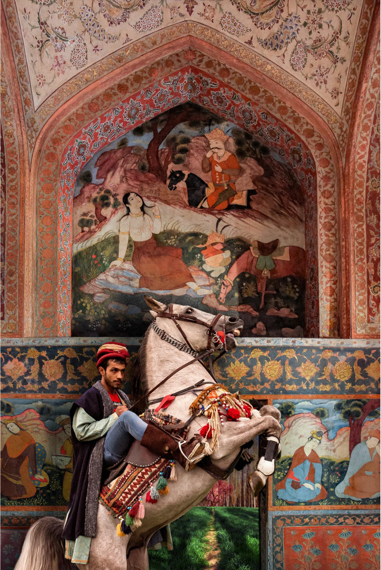
Khosrow and Shirin, 2021, +AP, Edition 1-5, 90x60 cm