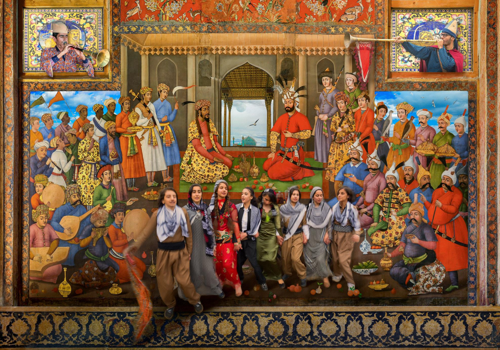
Royal reception, 2021, +AP, Edition 1-5, 70x100 cm