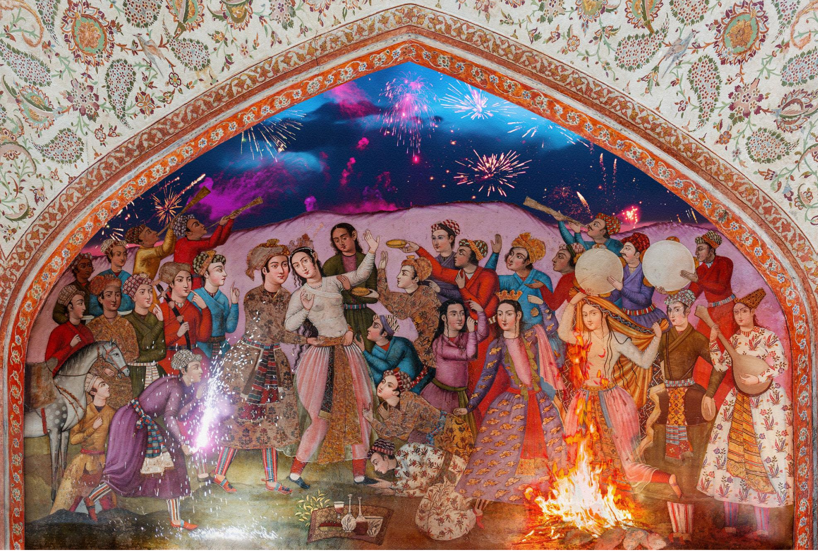
Fireworks Wednesday, 2021, +AP, Edition 1-5, 60x90 cm