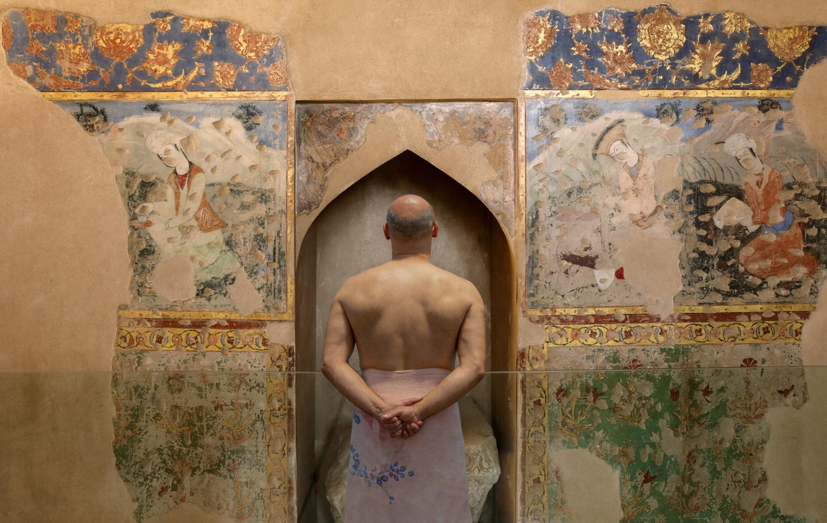
Wound of history, 2021, +AP, Edition 1-5, 60x90 cm