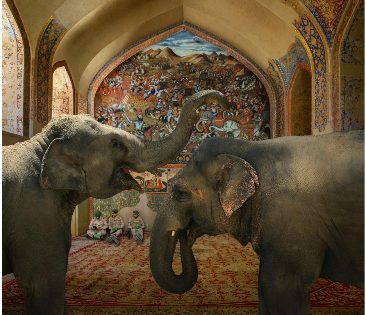
The dream of peace, 2021, +AP, Edition 1-5, 120x105 cm