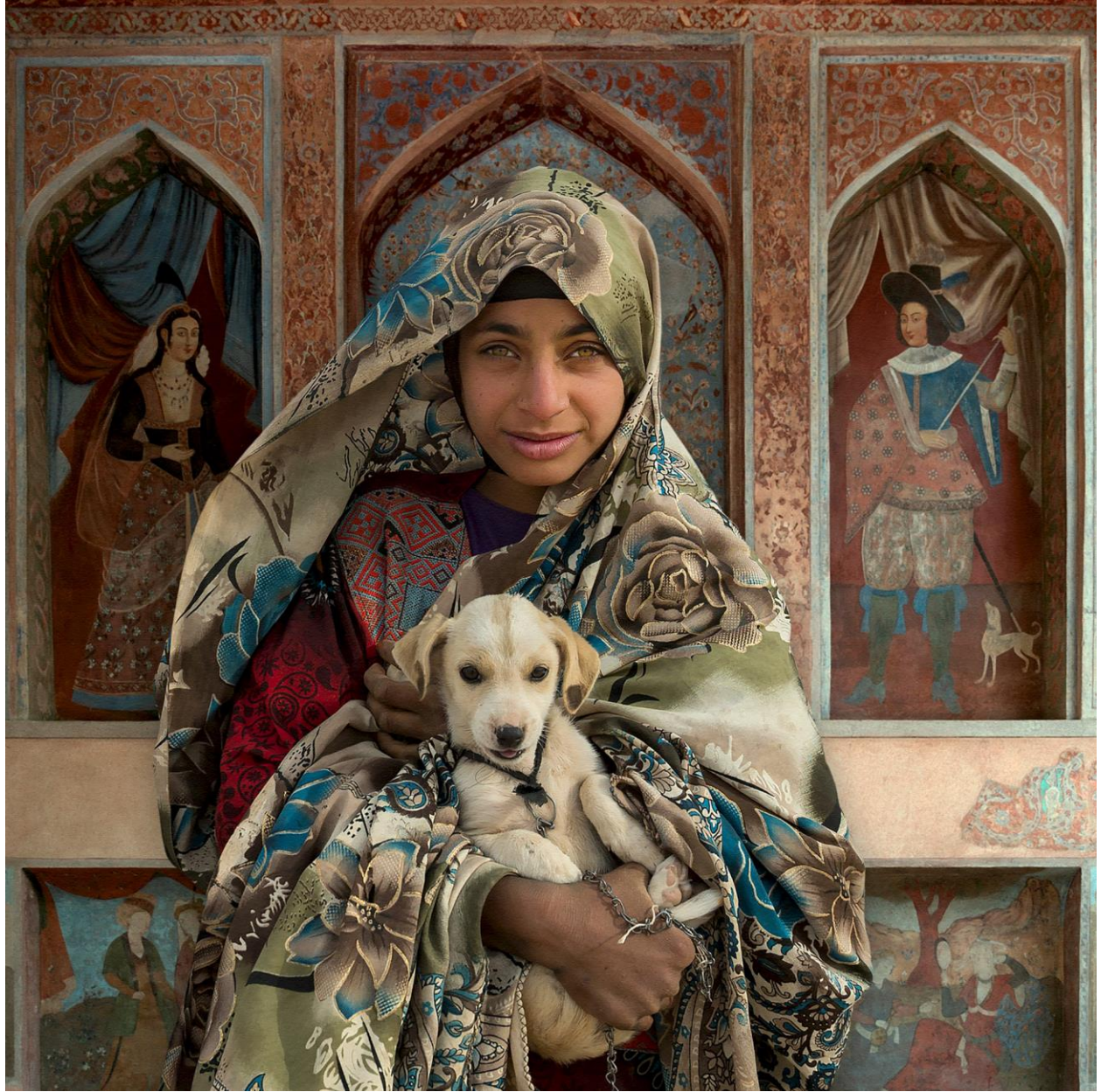
In the arms of history, 2020, +AP, Edition 1-5, 60x60 cm