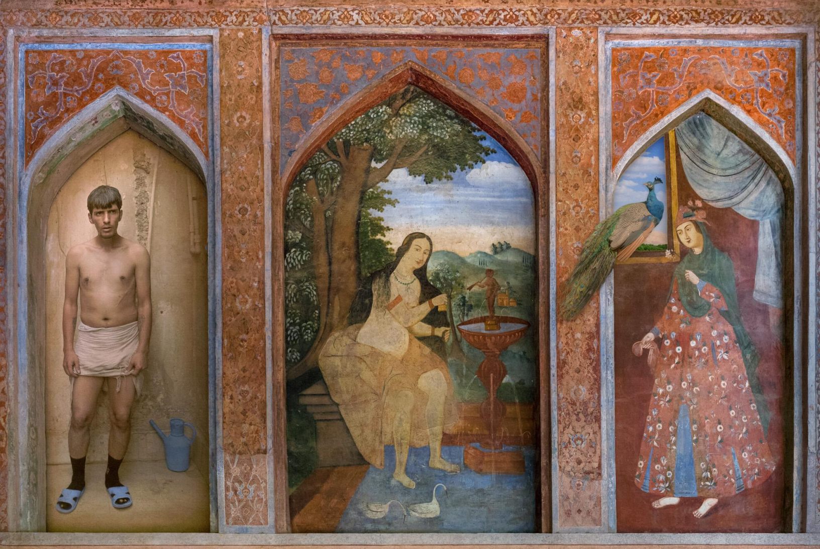
In the privacy of the bathroom, 2020, +AP, Edition 1-5, 60x90 cm