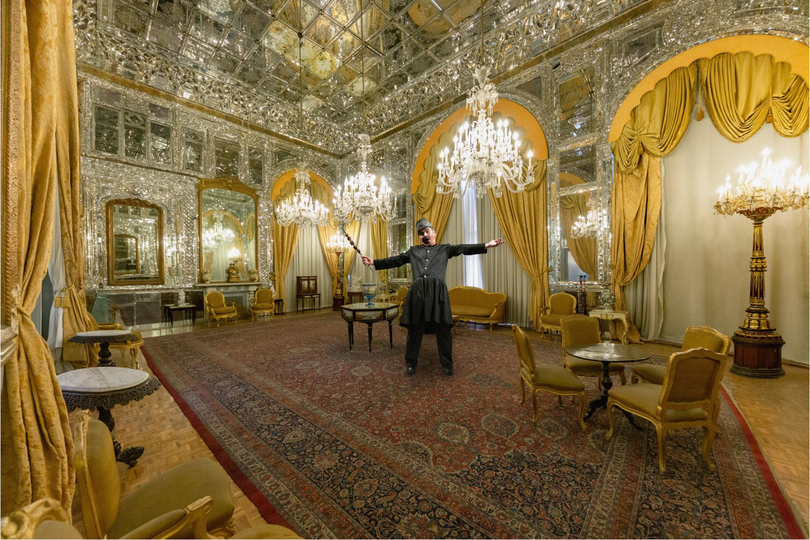
Mirror Hall, 2019, +AP, Edition 1-5, 60x90 cm