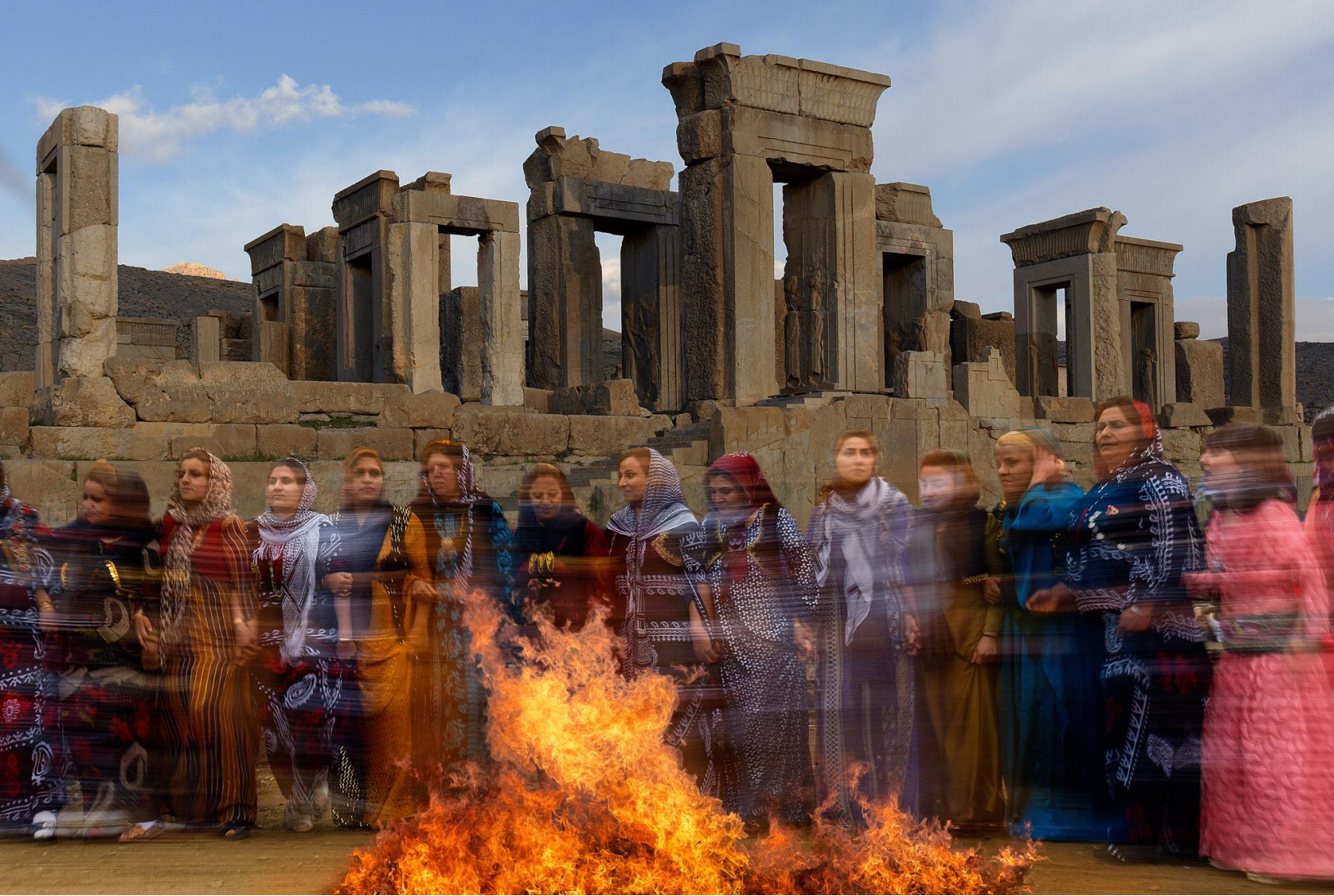
Fire Dance, 2019, +AP, Edition 1-5, 60x90 cm